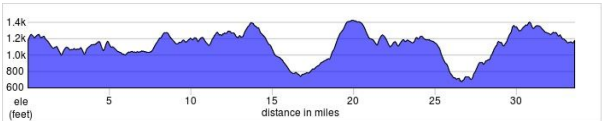
Medium Tour 33 Miles (Mile Markers: https://ridewithgps.com/routes/21114192 )