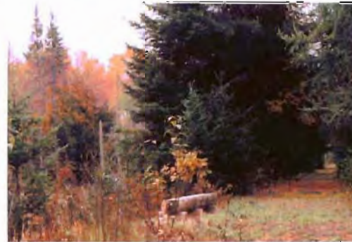
Benches for wildlife and scenic viewing

The Boltonville Nature Trail, spurring off the CVT, explores the upland slopes and riparian floodplain of the Wells River, offering a spectacular overlook of a waterfall on the Wells River. This trail is part of the interpretive farm project at the Al-len Farm.