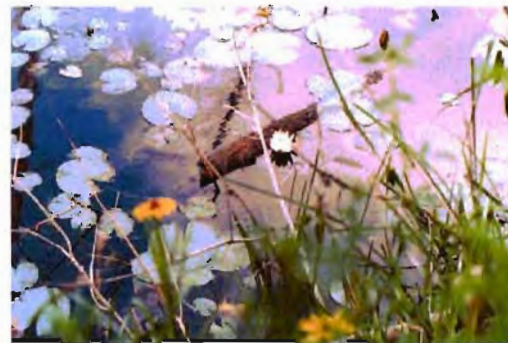
Experience important natural habitat